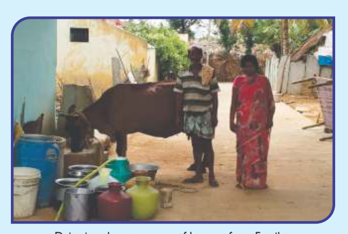
Dairy is a decent source of Income for a Family.