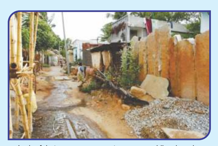
Lack of drainage system creating water puddles there by attracting mosquitoes and flies.