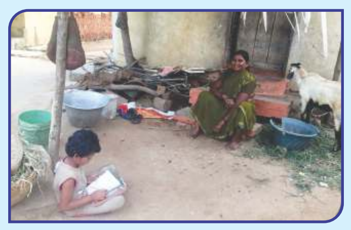
A girl child studying outside the hut in un hygienic atmosphere