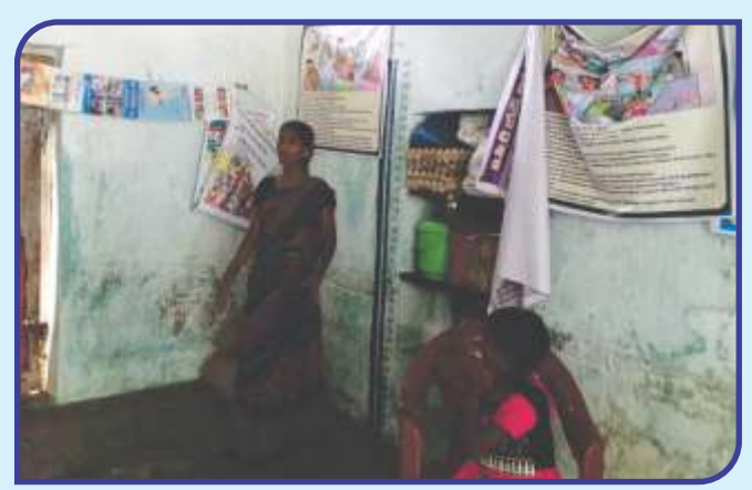
The only teacher available in the primary education centre