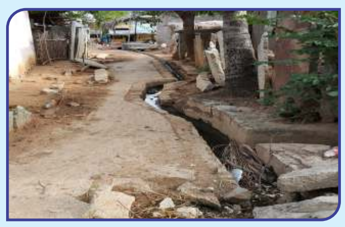
Drainage system half done and blocked.