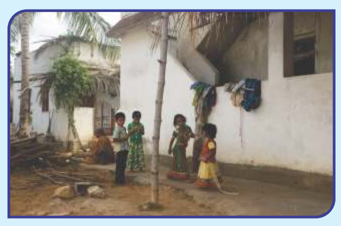
Children playing amongst harmful things without going to school.