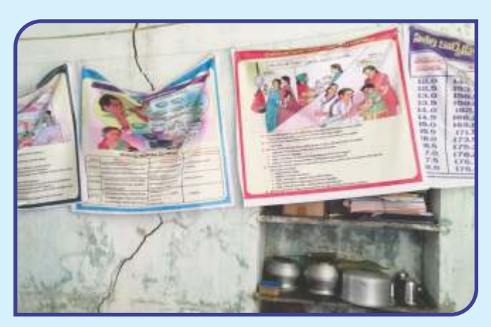
Education materials in Government Primary education centre