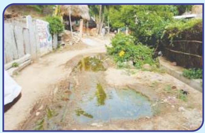
Lack of hygiene because of improper liquid waste disposal system & rain water harvesting mechanisms.