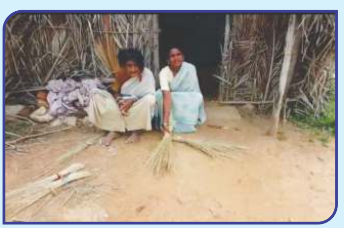
Ladies making brooms used for cleaning from sticks picked from local areas.